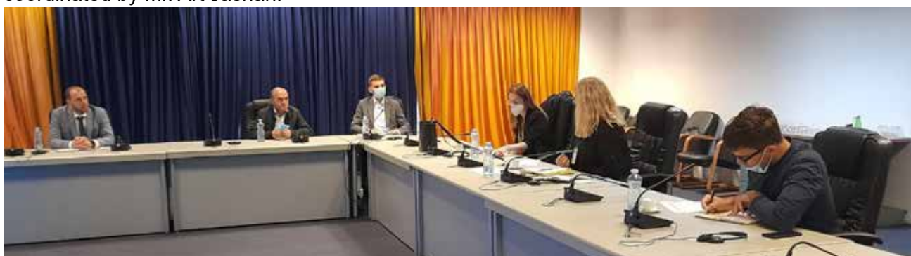
Photo 17: Meeting with the working group for Objective 2 of the Strategy