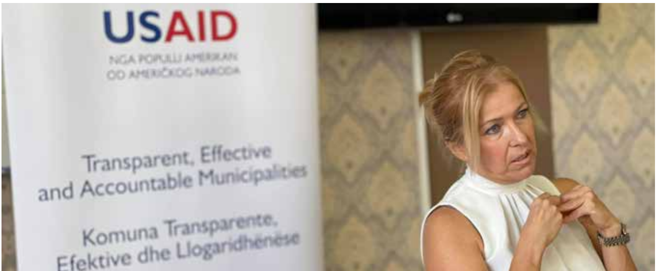
Photo 34: During the training for civil society organizations from North Mitrovica

During August 2021, the CiviKos Platform within USAID TEAM, provided two-day training for civil society organizations from North Mitrovica, Zvecan, Leposavic and Zubin Potok. The training and distributed materials focused on monitoring public procurement at the local level as well as cooperation with the media in exposing irregularities in procurement process.