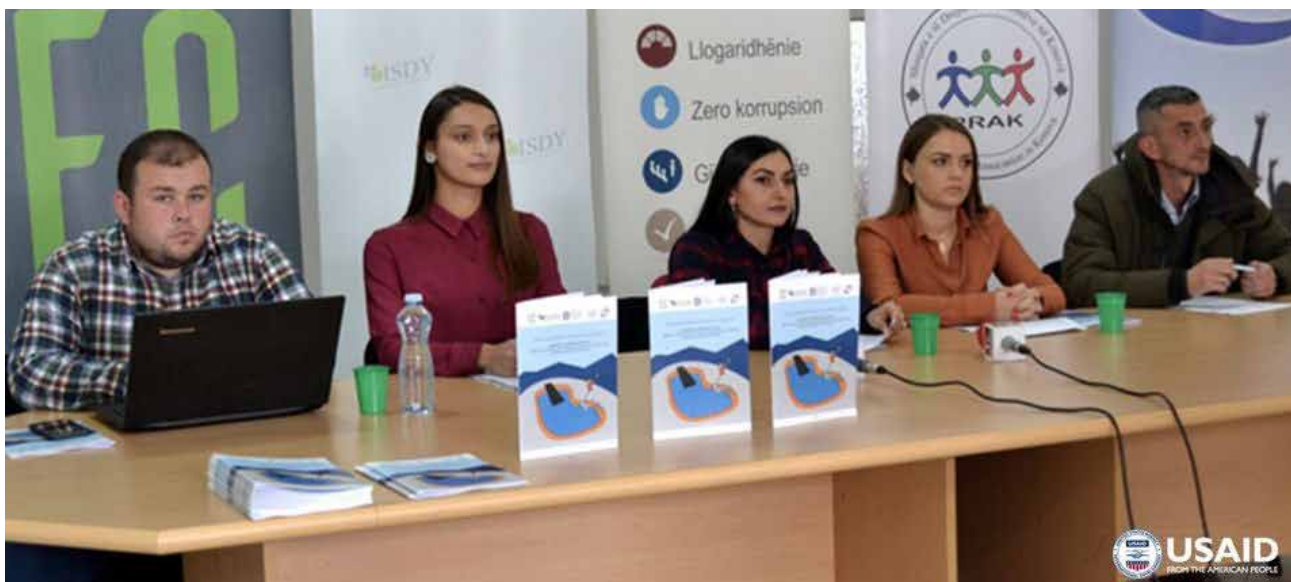
Photo 31: Presentation of the report by local organizations of Prizren region in monitoring public procurement activities

During 2021, as part of USAID’s Transparent, Effective and Accountable Municipalities (USAID TEAM) activity, workshops on applicable training were provided to support local organizations in monitoring public procurement activities. Experts engaged by CiviKos have assisted local organizations throughout the entire process of monitoring procurement activities in their respective municipalities. The workshops were offered to local organizations from seven regions of Kosovo: Prishtina, Prizren, Peja, South Mitrovica, North Mitrovica, Gjilan and Ferizaj.