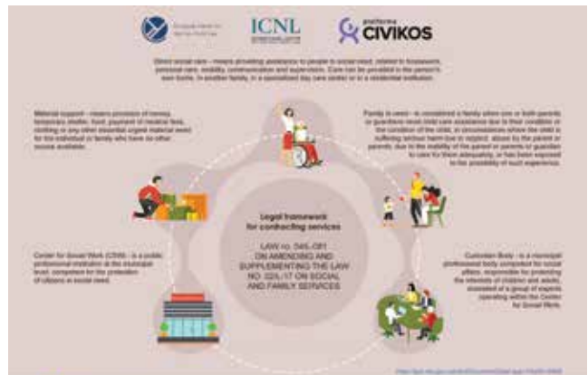
Sweden Sverige "This infographic is wholly financed by the Government of Sweden. The Government of Sweden does not necessarily share the opinions here within expressed. The author bears the sole responsibility for the content."