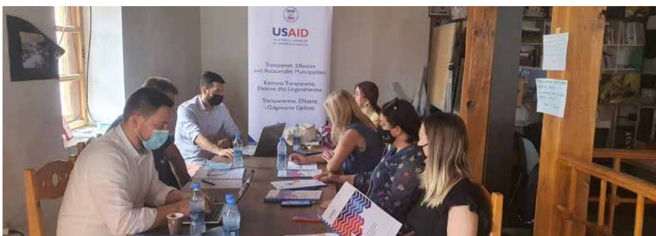
Photo 32: Workshop of local organizations in the Peja region for monitoring of public procurement activities