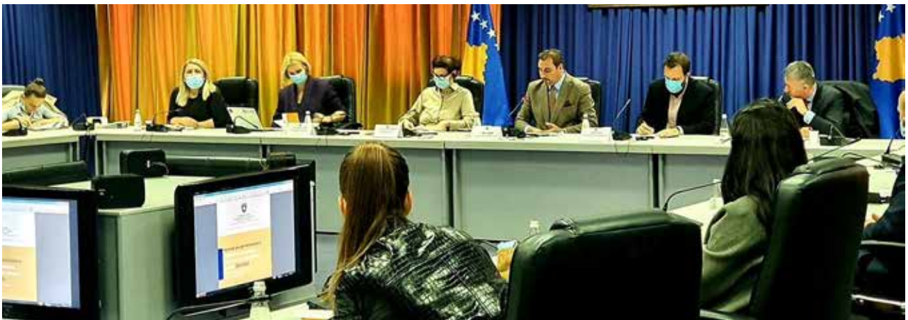
Photo 24: Photo during the meeting with the coordinators of the working teams of the Council for Cooperation between Civil Society and Government, and TACSO in Kosovo