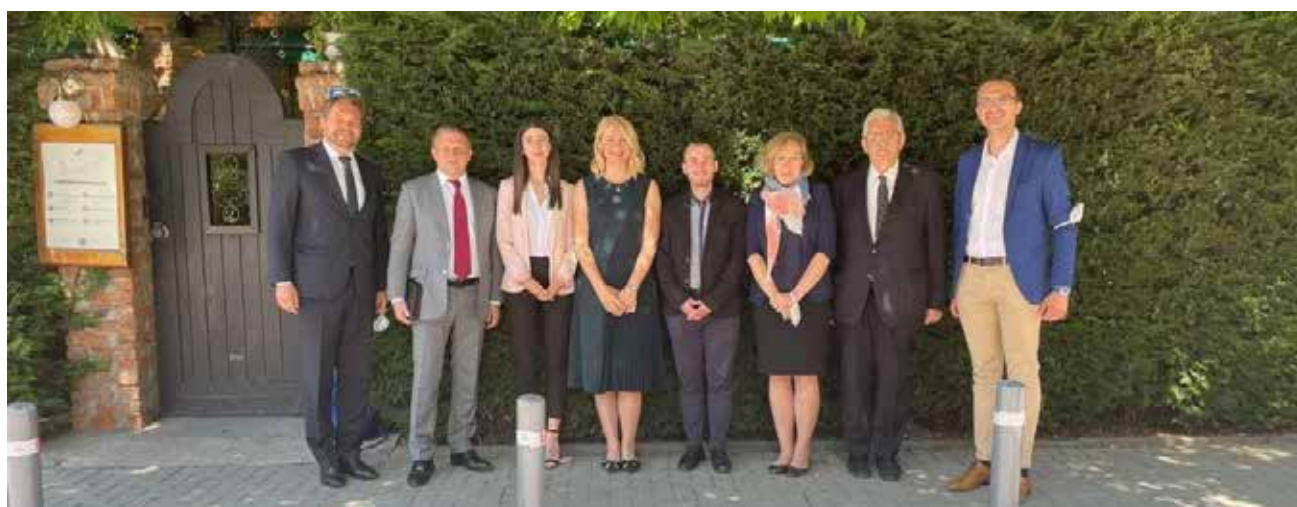
Photo 47: Researchers and experts of the International Group Visegrad Fund (V4), in Prishtina

During this round of visits, experts had the opportunity to meet with officials from the Government of the Republic of Kosovo, representatives of the Assembly of Kosovo and political parties, and officials of EU institutions and foreign diplomatic missions in Kosovo.