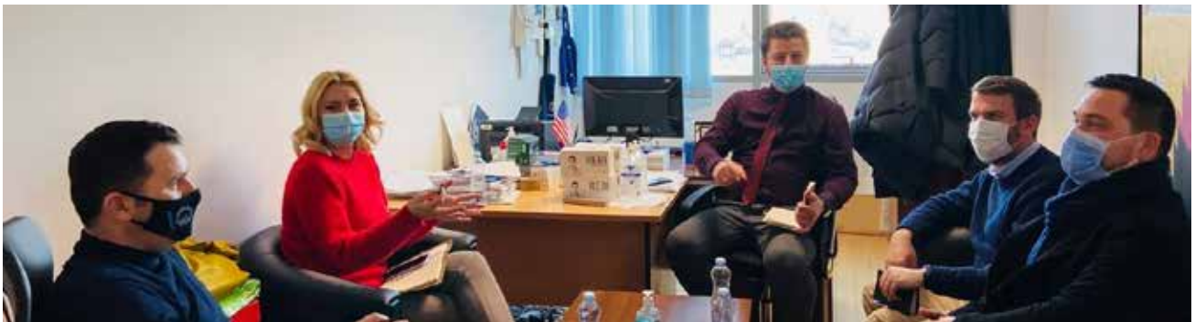
Photo 27: Meeting with representatives of MLGA

On January 19, as part of USAID Project for Transparent, Effective, and Accountable Municipalities, CiviKos met with representatives of the Ministry of Local Government Administration (MLGA). In this meeting it was discussed about the possibility of creating a grant scheme for civil society organizations that monitor public procurement at the local level. The establishment of this scheme is of particular importance to local organizations, as it would ensure sustainability for them even after the end of USAID activity.