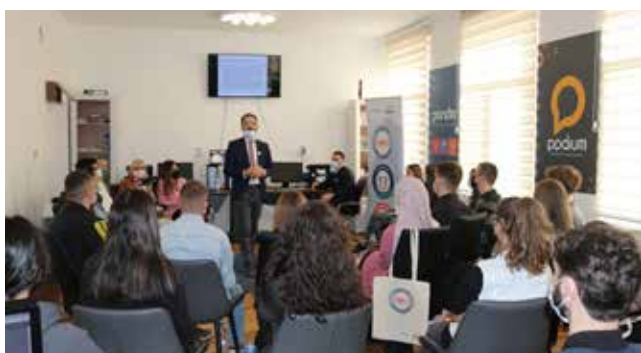
Photo 7: Meeting with the doctor in Dragash

During these visits, participants had the opportunity to attend a detailed lecture on how the COVID-19 vaccine was produced, how it is accepted by our body, and the importance of using it as the only tool to fight and end the pandemic. Such visit in this format also provided the opportunity for each participant to address their concerns, reservations and questions directly with professionals in the field. In fact, this format was so well received that our local partner organizations who have enabled