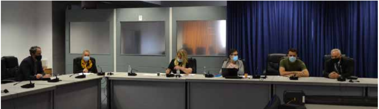
Photo 23: Meeting with the working group for Objective 4 of the Government Strategy