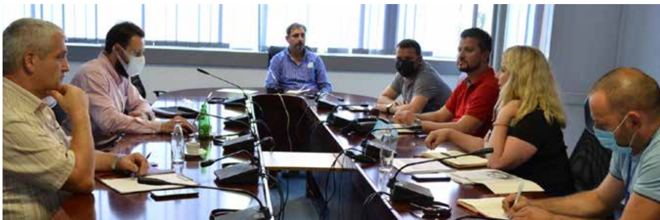
Photo 16: Meeting with the working group for Objective 1 of the Strategy