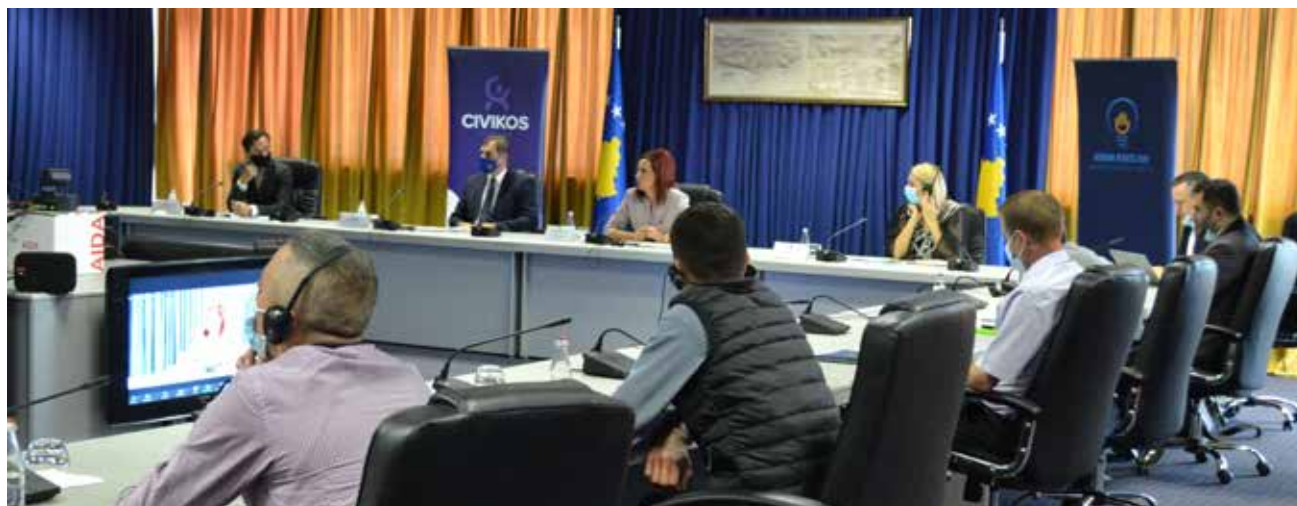
Photo 46: Conference 'The Role of Civil Society in Human Rights Advocacy'

Due to measures against COVID-19 at the time, the number of conference participants was limited, and the conference was organized in a hybrid format to enable input from other stakeholders and interested parties.