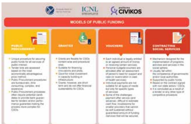
Sweden Sverige "This infographic is wholly financed by the Government of Sweden. The Government of Sweden does not necessarily share the opinions here within expressed. The author bears the sole responsibility for the content."