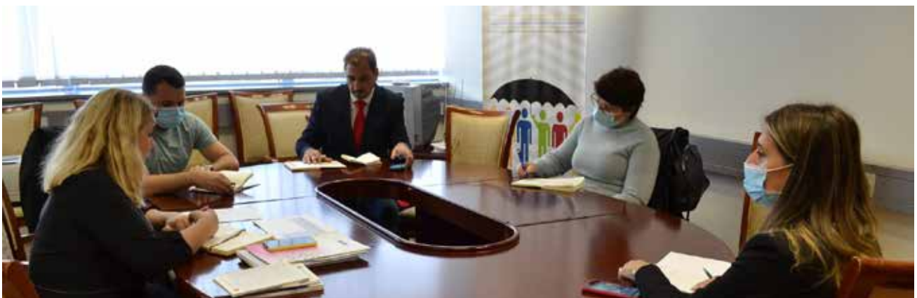
Photo 25: Photo during the meeting with the coordinators of the working teams of the Council for Cooperation between Civil Society and Government, and TACSO in Kosovo