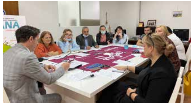
Photo 43: Workshop in Klina

Visual summary of the workshops within the project 'You Cannot Be What You Cannot See'