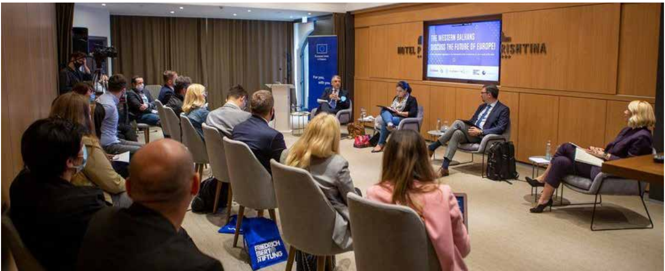
Photo 49: Conference 'Western Balkans Discusses about Europe's Future'

The data from the previous focus group and the cooperation of the partners that enabled it, were elaborated in more details at the conference 'Western Balkans Discuss the Future of Europe', organized by CiviKos. The discussion was opened by the Head of the EU Office in Kosovo, Mr. Tomas Szunyog.