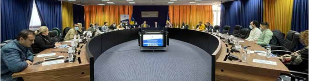
Photo 26: Concluding meeting of the Council for Cooperation Civil Society and Government

On December 23, the final meeting of the Council for Cooperation Civil Society and Government was held. During the meeting the working groups presented the achievements and challenges for the four objectives of the strategy as well as the plans for the full implementation of these objectives. The COVID-19 pandemic as well as the frequent changes of governments in Kosovo were considered as the main challenges for implementing the strategy.