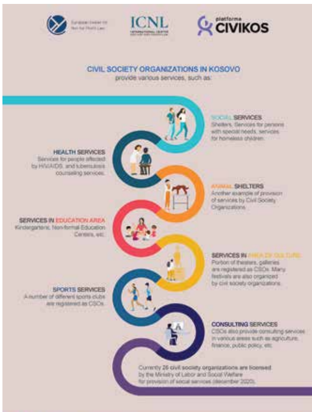
Sweden Sverige "This infographic is wholly financed by the Government of Sweden. The Government of Sweden does not necessarily share the opinions here within expressed. The author bears the sole responsibility for the content."