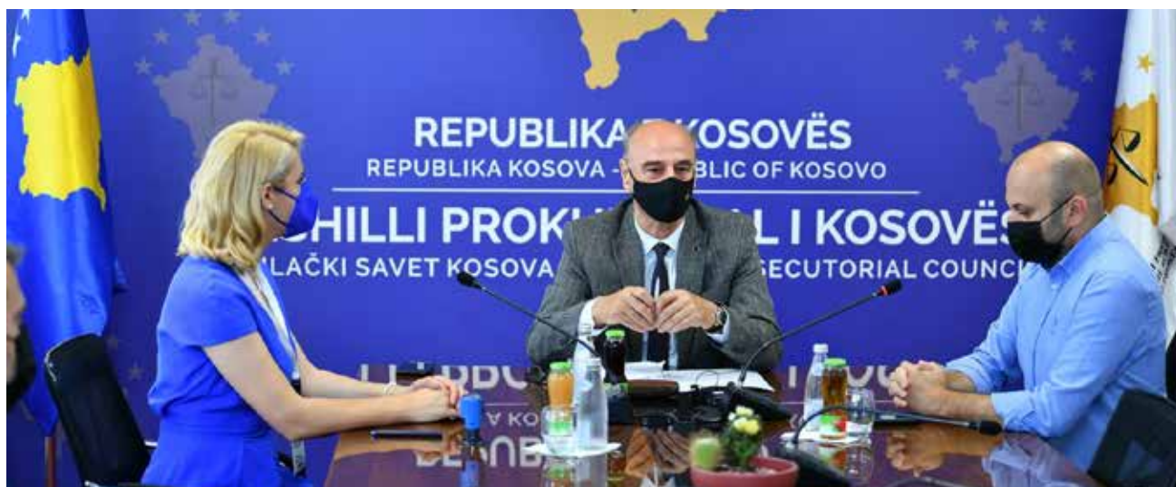
Photo 30: Moments from signing of the Memorandum of Understanding between CiviKos, The Press Council and the Kosovo Prosecutorial Council

The Memorandum, prepared with the assistance of USAID's Transparent, Effective and Accountable Municipalities, provides the opportunity to establish standard procedures for submitting identified cases and involving KPC in provision of feedback that enables organizations of civil society and the media to follow (observe) submitted cases.