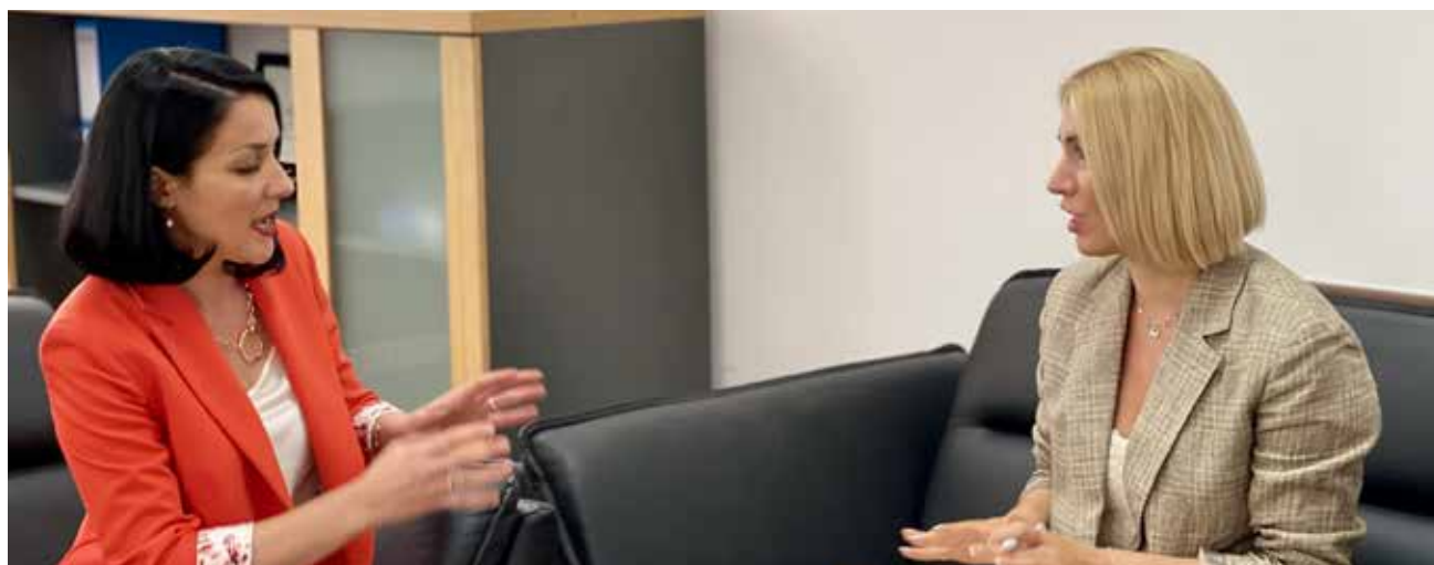
Photo 29: Meeting with the Commissioner of the Information and Privacy Agency

During August, CiviKos continued meetings with the Commissioner of the Information and Privacy Agency, Mrs. Krenare Sogojeva Dermaku, to intensify cooperation in order to promote the implementation of the Law on Personal Data Protection, address the lack of access to NGOs to public information by public institutions, and establish a system for monitoring the implementation of the Law for Access to Public Documents.