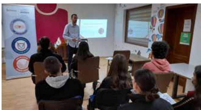
Photo 9: Meeting with the doctor in Gjakova