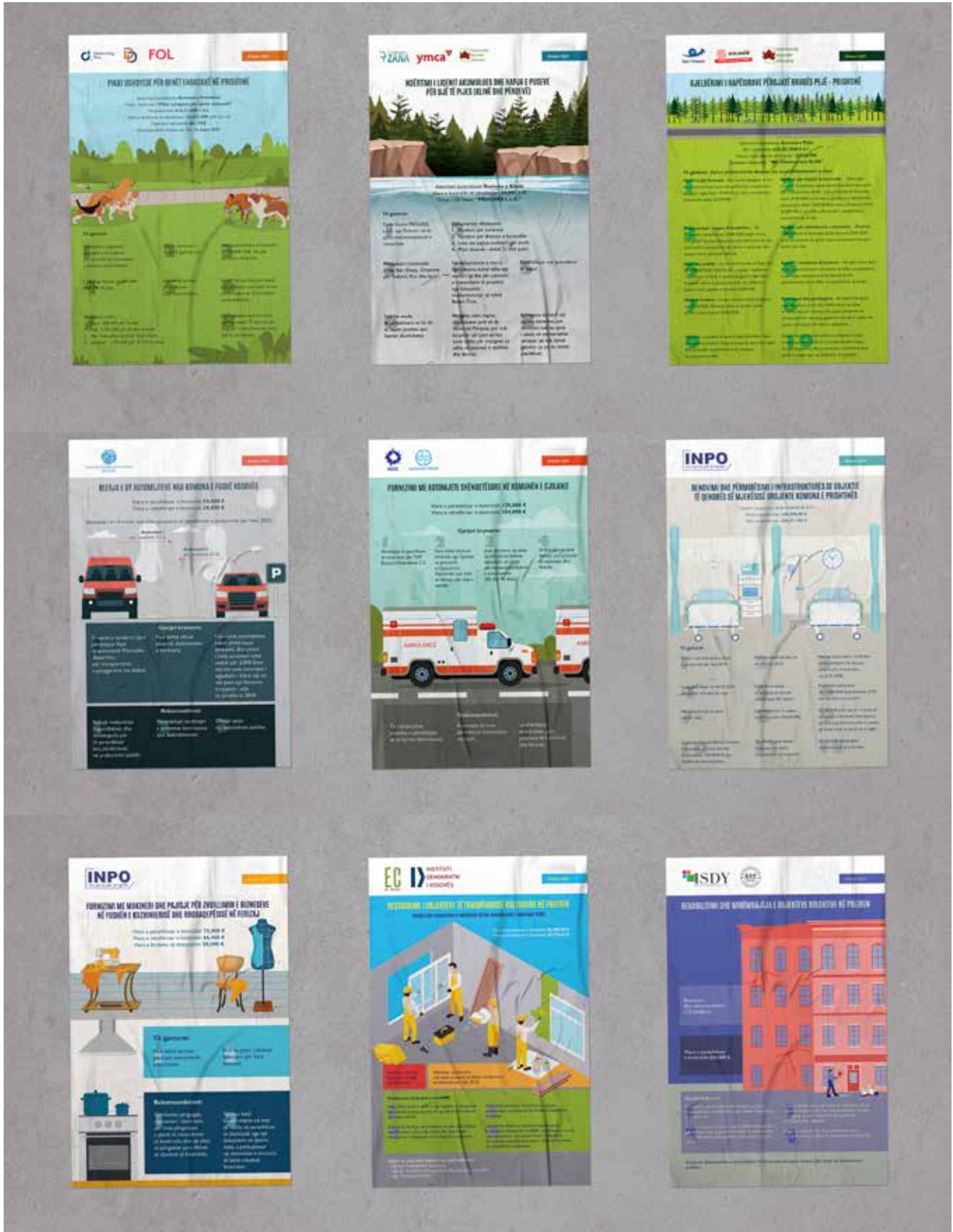
Photo 33: Reports of civil society organizations published in Infographics

During February and March, civil society organizations published findings reports in form of infographics on contracts which they monitored in their municipalities. The findings published by the beneficiary organizations were as follows: