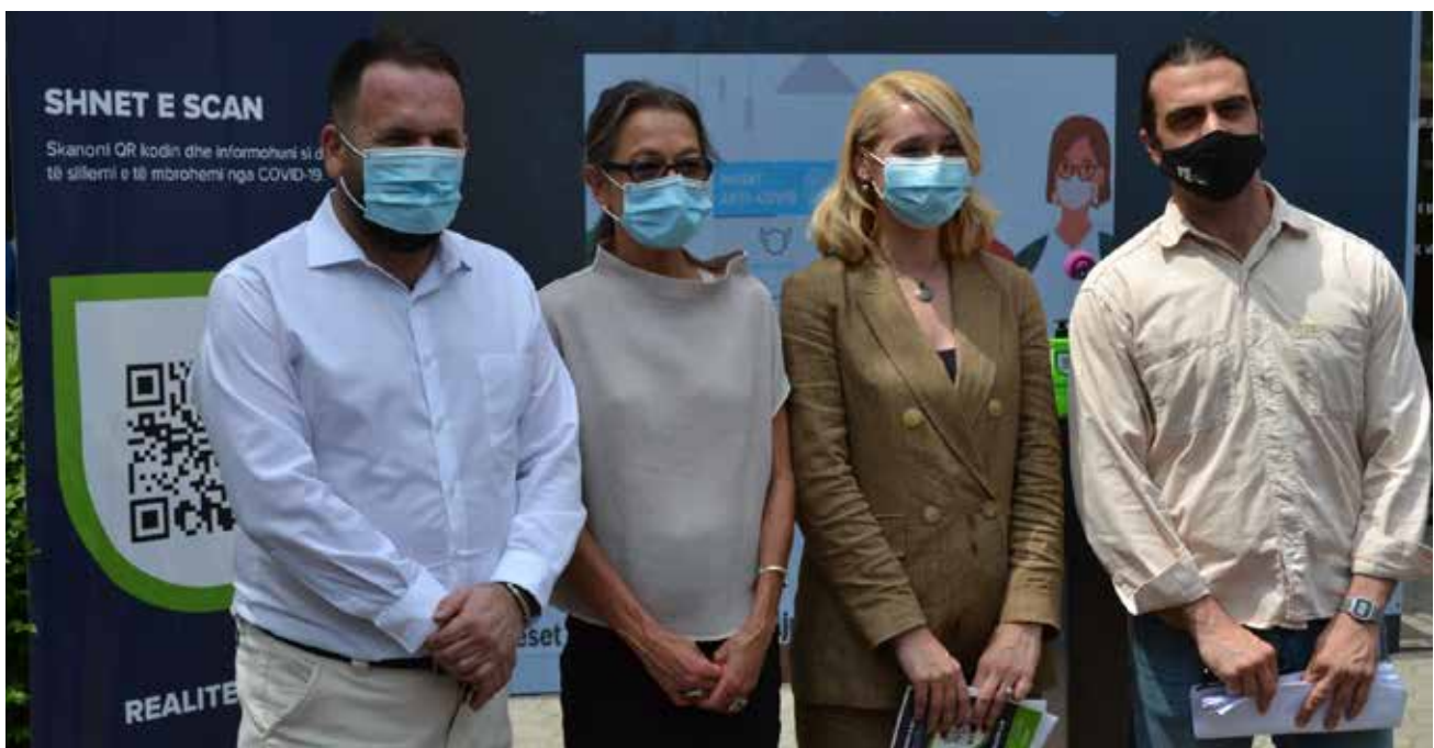
Photo 1: Partners of New Reality project in launching of the platform

The multilateral cooperation platform, named Realiteti i ri (New Reality), came in response to the need to disseminate and simplify reliable and up-to-date information on measures against COVID-19, focusing on health and safety in private sector workplace. Beyond this vital information about the pandemic, in one place, the platform provided all the publications and research done about the pandemic and the private sector, information and guidance on financial aid, information from the World Health Organization (WHO) for proper information on COVID-19 Mythbusters, promoting businesses that were trained on workplace health and safety in relation to the virus, and other relevant and up-to-date information. The platform was launched in May 2021.